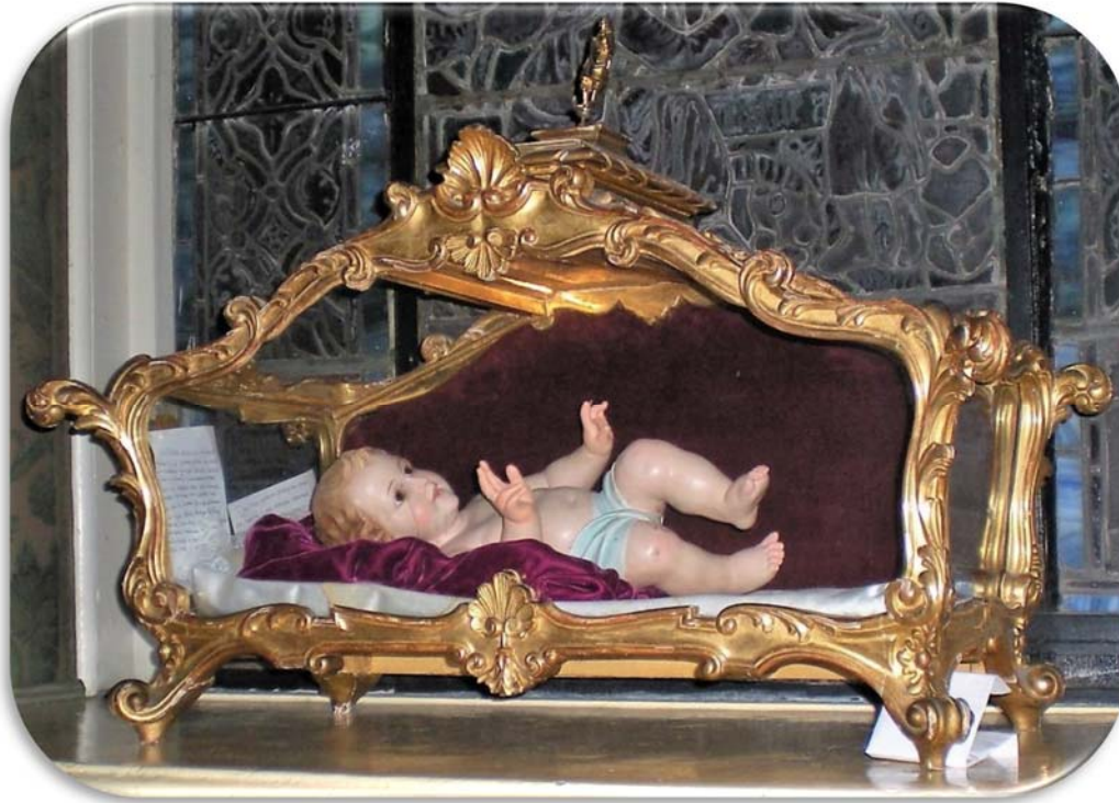
Holy Infant at the San Agustin Cathedral