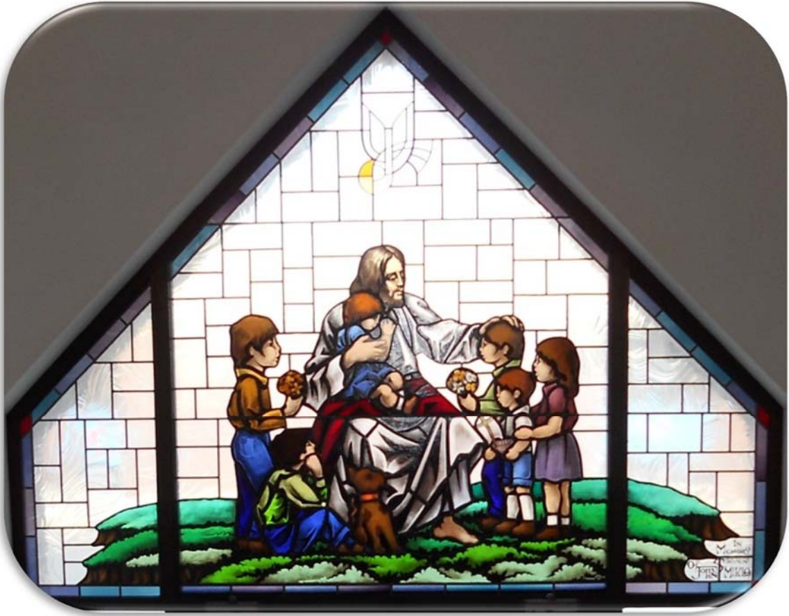
Immaculate Conception Church & Holy Rosary Cathedral, respectively